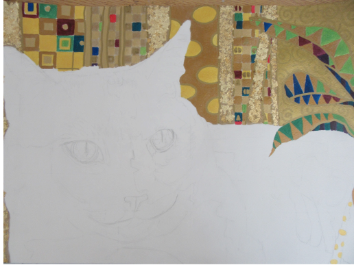
Created and painted a background inspired by klimt